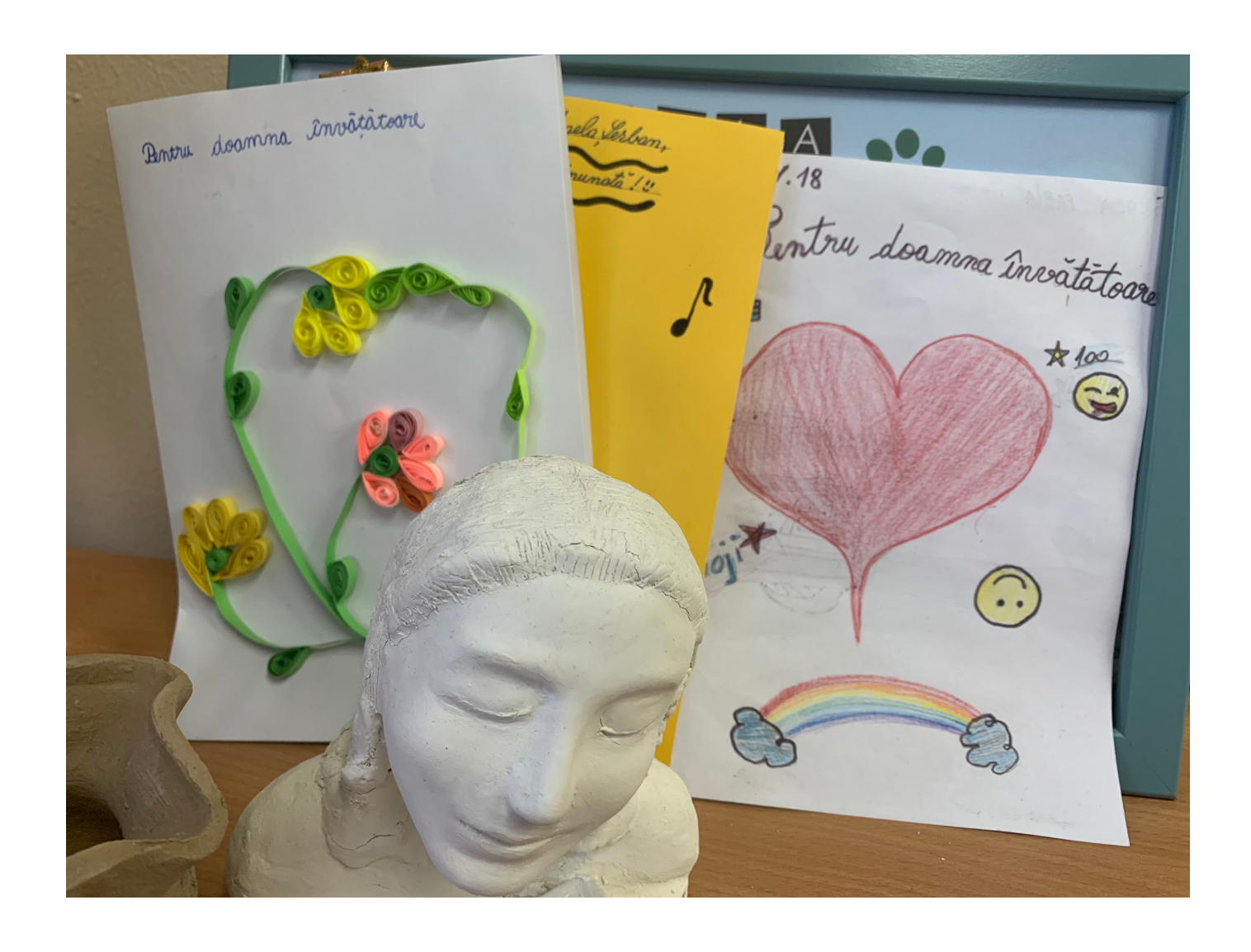
Urari Pentru Doamna Invatatoare De Sfarsit De An